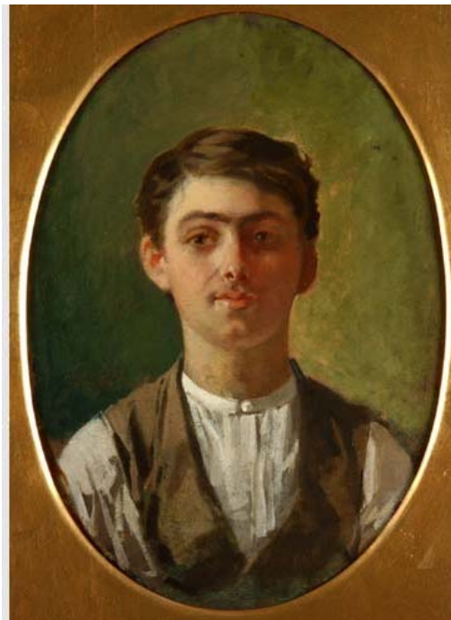
Giuseppe Pellizza da Volpedo – Autoritratto

You'll reach Tortona by bike along an amazing flat track. Visit to the art gallery belonging to Fondazione Cassa di Risparmio which displays some important Pellizza's oils on canvas as well as other Divisionist painters' such as Plinio Nomellini's.