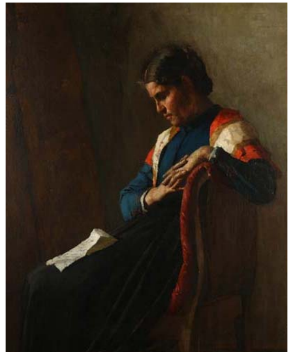
Giuseppe Pellizza da Volpedo - La donna dell'emigrato